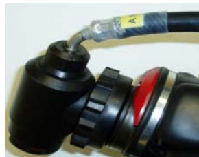
Medium pressure line