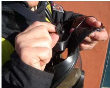
Drager PA94 plus