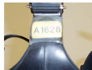
Head harness strap