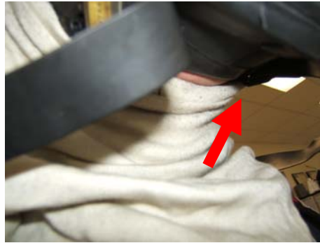
Photographs showing the areas where protective hoods may get caught.